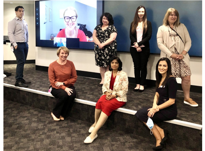
Our first PUG meeting: Women’s Health