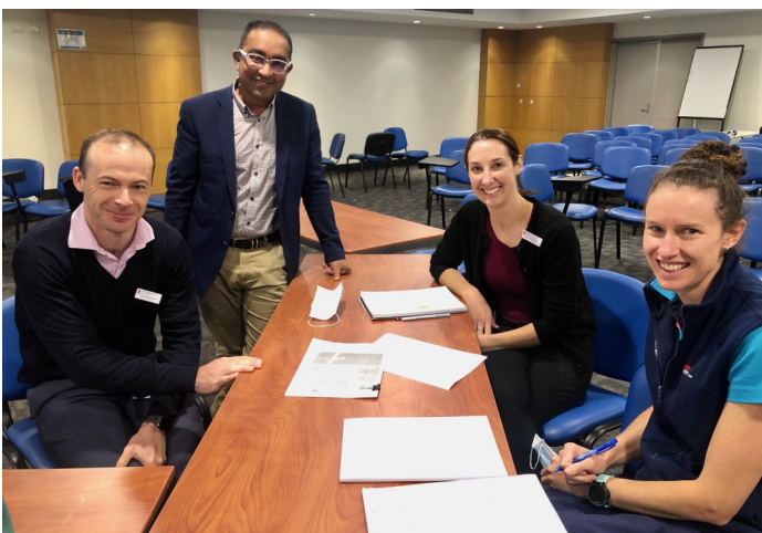
Intensive Care Unit PUG meeting